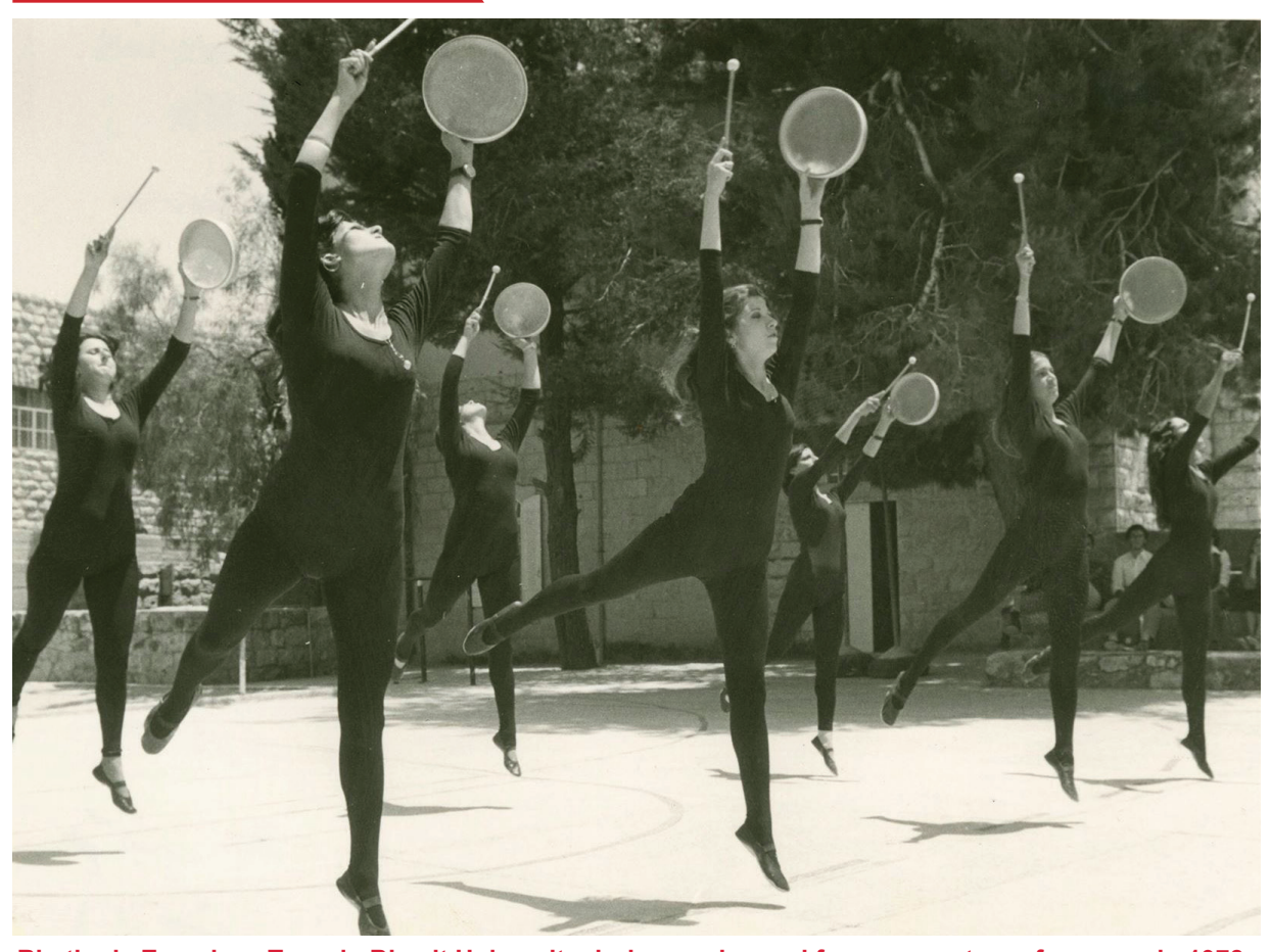
Rhythmic Exercises Team in Birzeit University during a rehearsal for one sports performance in 1978.

In collaboration with the Palestinian Museum at Birzeit University, Al-Hal publishes a photo in each edition to remind us of the past and evoke happy memories that have faded as a result of limited documentation and publication.