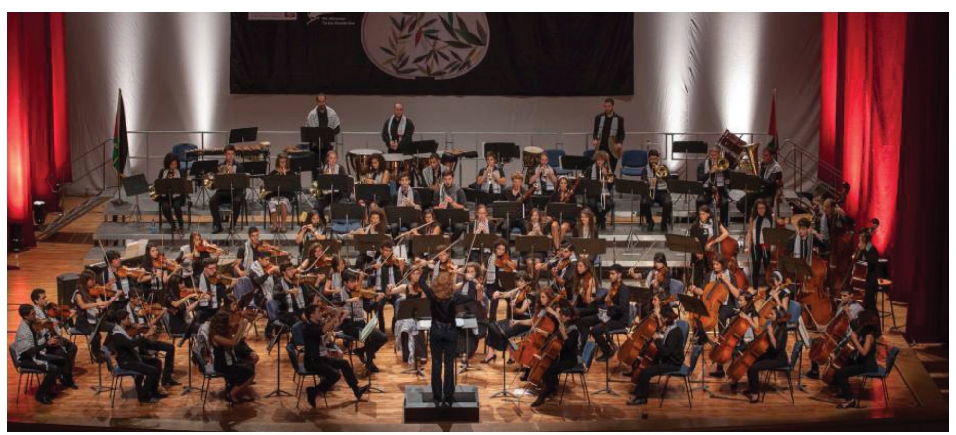
A performance by the Palestine Youth Orchestra.