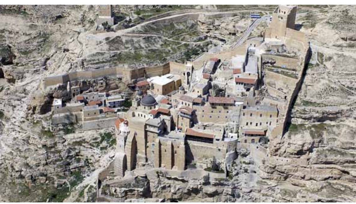
The monastery from a distance as photography is not allowed inside.

Gayatha noted that women are not allowed to enter the monastery because they believe that if just one woman enters inside the monastery, it will collapse on the residents because, according to their beliefs, women are worldly temptation that block communication and access to the blessings of God Almighty. The only building that can be accessed by