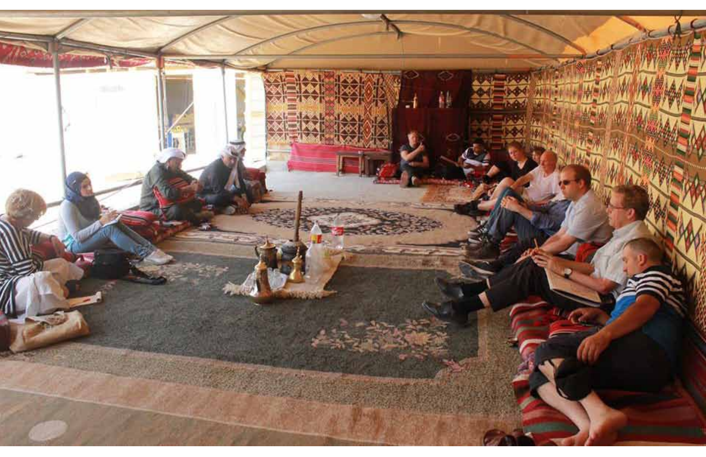
Al-Hal reporter in a Bedouin tourist tent.

He added: "Bedouin are one entity. We aim to expand the project via a joint tourist network in the West Bank, in cooperation with all Bedouin communities, to receive