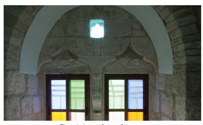
The windows of one of the rooms.

On the second floor, there are five rooms in a circular shape with a courtyard in the middle; there is a small garden in one of its corners where a pistachio tree is planted. There is a wide opening in the middle of this upper Hoach